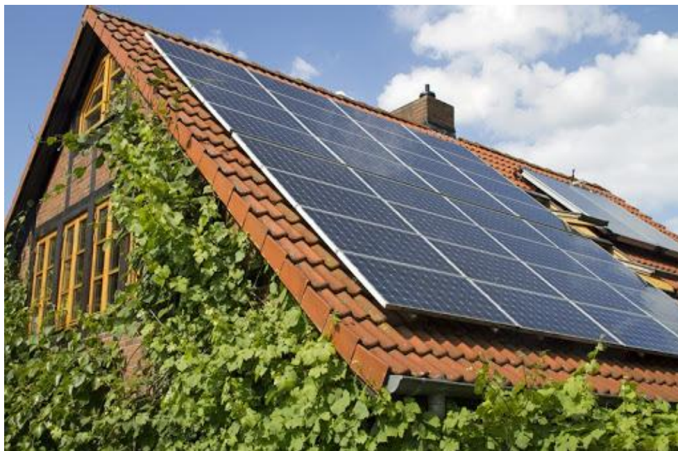
Fig. 1: Placing the solar panels on the roofs of the houses.

which results in uncontrolled production of building environmental pollutants, and on the other hand, lack of compliance with standards and lack of insulation in many buildings has led to increased fuel consumption. Fuel consumption is a result of technical deficiencies in buildings and appliances, and the current situation has worsened fuel consumption [8]. Discussions and studies regarding the use of solar energy in building and due to the large amount of daylight available on buildings, with the proper reception, accumulation and distribution of solar energy can be achieved using minimal heating or cooling energy through Better understanding of the properties of materials led to superior quality in operation [9]. Discussion of studies and studies regarding the use of solar energy in building and due to the large amount of daylight available on buildings, with the proper reception, accumulation and distribution of solar energy can be achieved with minimal heating or cooling energy through better understanding of the properties of materials led to superior quality in operation [10].